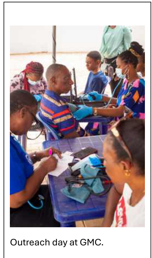
Outreach day at GMC.