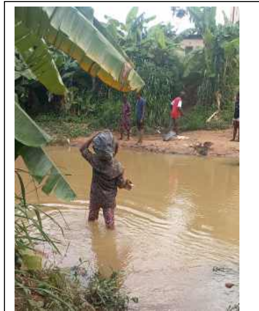
Crossing the Avah River

To address inaccessibility to the nearby quality healthcare at the Goodwill Medical Centre, the communities strongly advocated for the construction of a pedestrian and tricycle- - accessible bridge. An anonymous donor and friends have contributed towards this cause, with a financial donation that can cover part of the estimated cost, while residents in the settlements have the responsibility of clearing the bushes and constructing a pathway road to further ease access through the bridge to GMC. Approximately, one-third of the estimated funds for the bridge is required for the completion of this priority project, which will improve access and reduce maternal and neonatal fatalities or case complications due to avoidable delays.